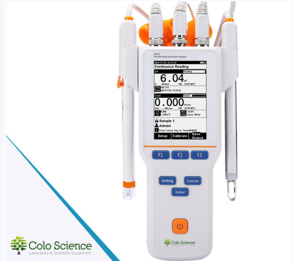
VIKING-M310F · portable pH / EC / ISE / DO water analyzer · main unit

Format: A4 landscape · COLO.Science TechSpec template with navigation links