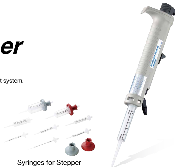
Syringes for Stepper