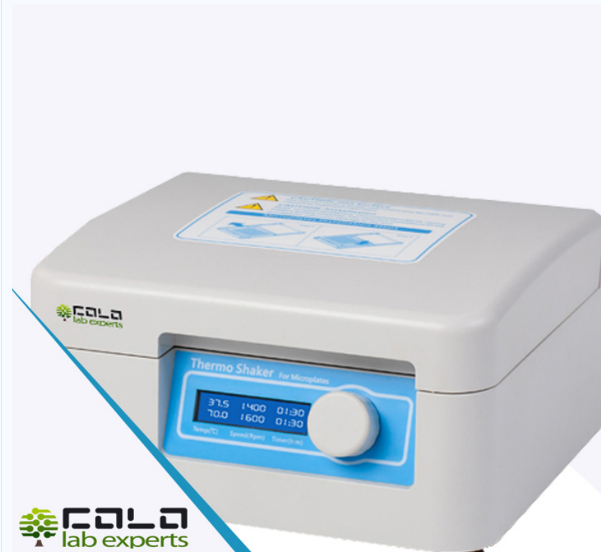
MTP200 · thermo shaker for microplates · main unit

Format: A4 landscape · COLO.Science TechSpec v2.3 · Stable six-page layout